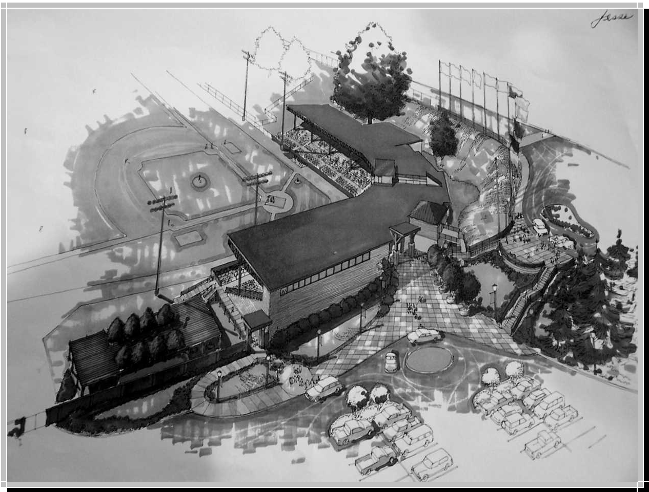
The Proposed Duncan Park ball field...What an improvement!

Phone (864) 814-1078, Fax (864) 599-5456 or Email: jbharbisonj@bellsouth.net